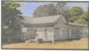
407 S. John Street, Dillon-Ralford House