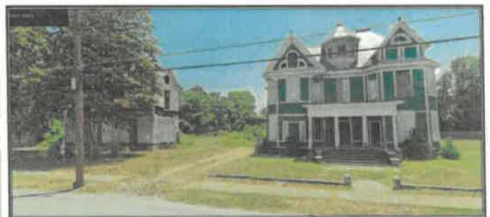
306 S. John Street, George A. Norwood House